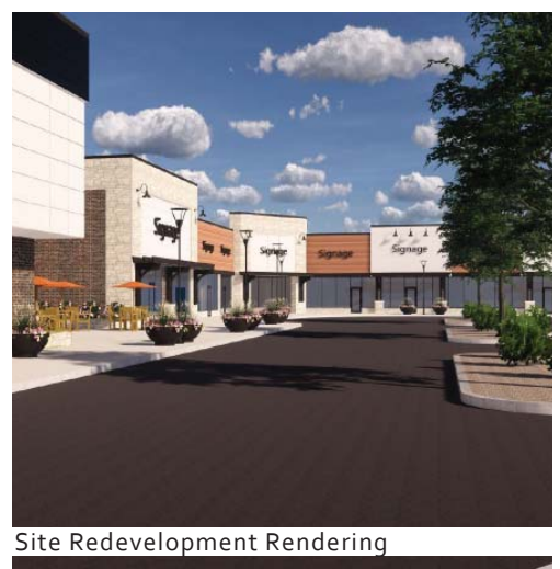
Site Redevelopment Rendering