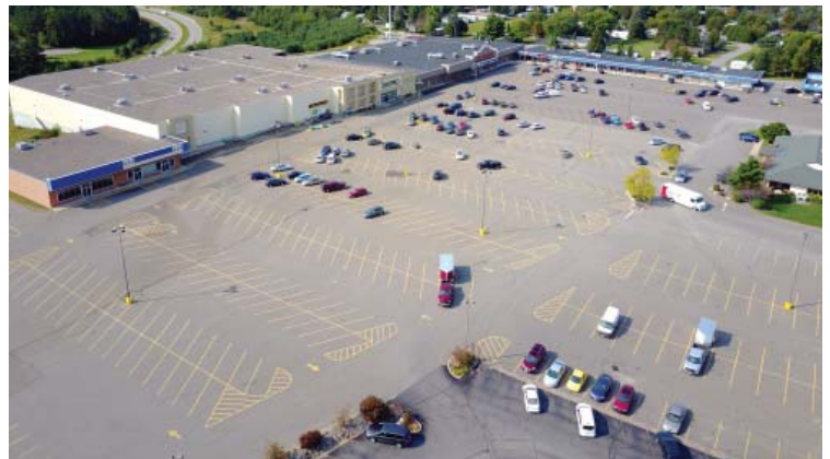
East Pointe Plaza

For More Information Contact: Peter Jungbacker (920) 233 - 7219 ext. 18 pjungbacker@alexanderbishop.com