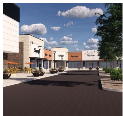
Site Redevelopment Rendering

LEASING INFO: PETER JUNGBACKER - 920.233.7219 EXT.18