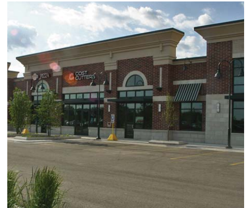
Renovated facade will be a style similar to our building above

Traffic Counts: Koeller St. 15,000 VPD (2009) Traffic Counts: Hwy 41 60,600 VPD (2010)