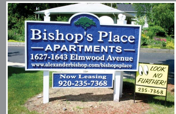
Bishops Place Entrance

Filled with natural light, plush carpet, and hardwood floors, these units are recently remodeled and each have their own patio/ balcony. Also included is extra time for your own relaxation because included in your rent is heat, water, and internet access, giving you less to think about.