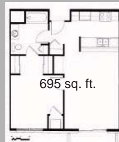
1 Bedroom w/ Balcony