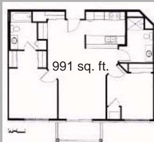
2 Bedroom w/ Balcony