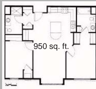
2 Bedroom 2 Bath