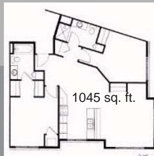
2 Bedroom Deluxe